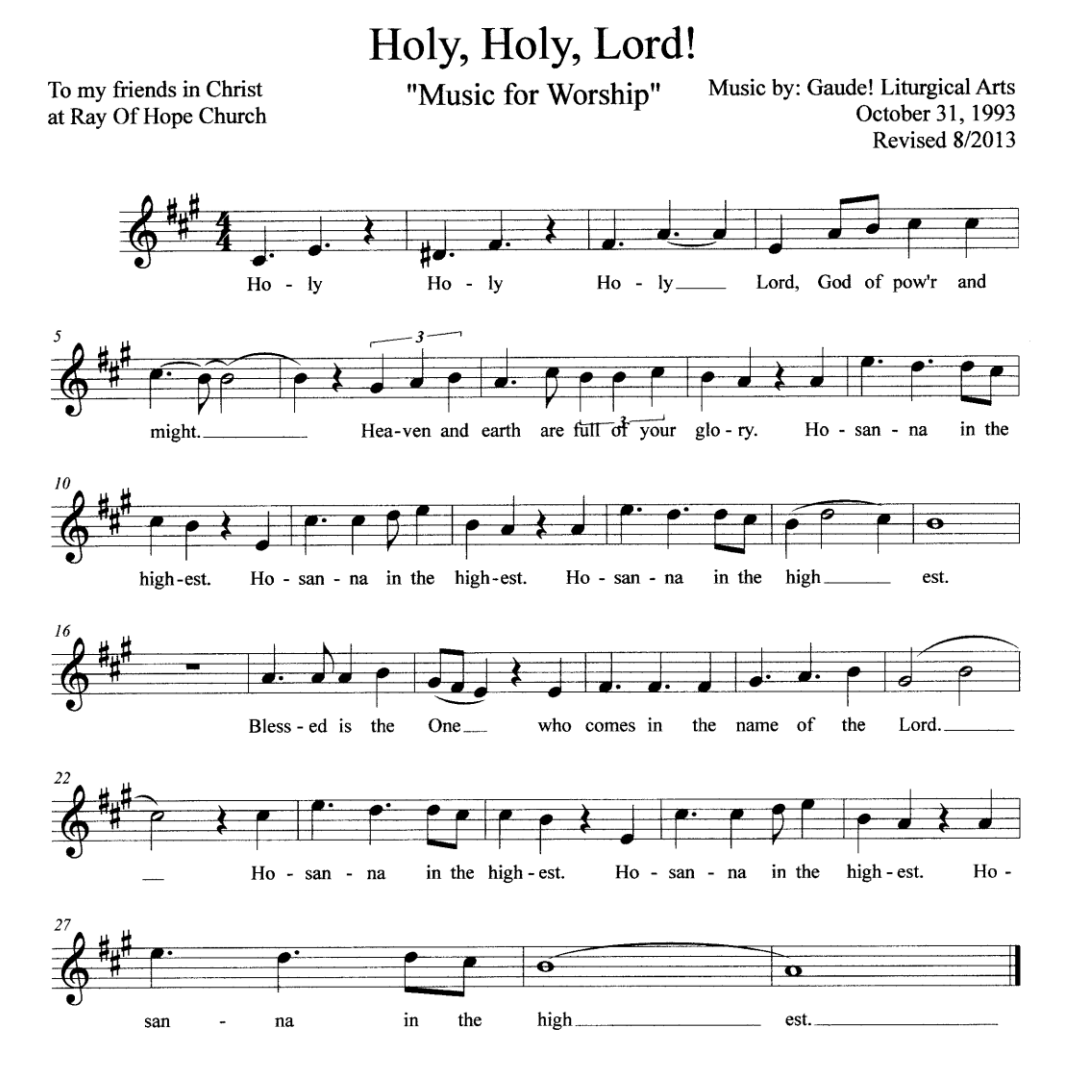
©1993 by Gaude! Liturgical Arts. All Rights Reserved. International Copyright Secured. Reprinted here under CCLI#706121