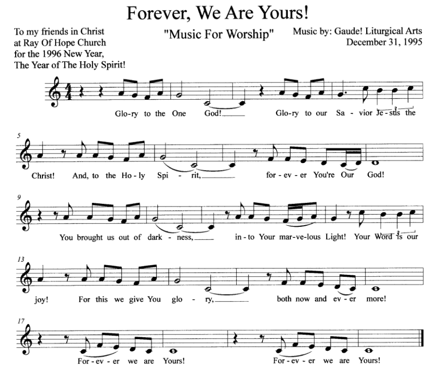
©1993 by Gaude! Liturgical Arts. All Rights Reserved. International Copyright Secured. Reprinted here under CCLI#706121